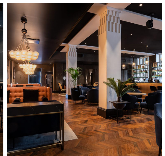
SCANDIC GRAND CENTRAL HELSINKI