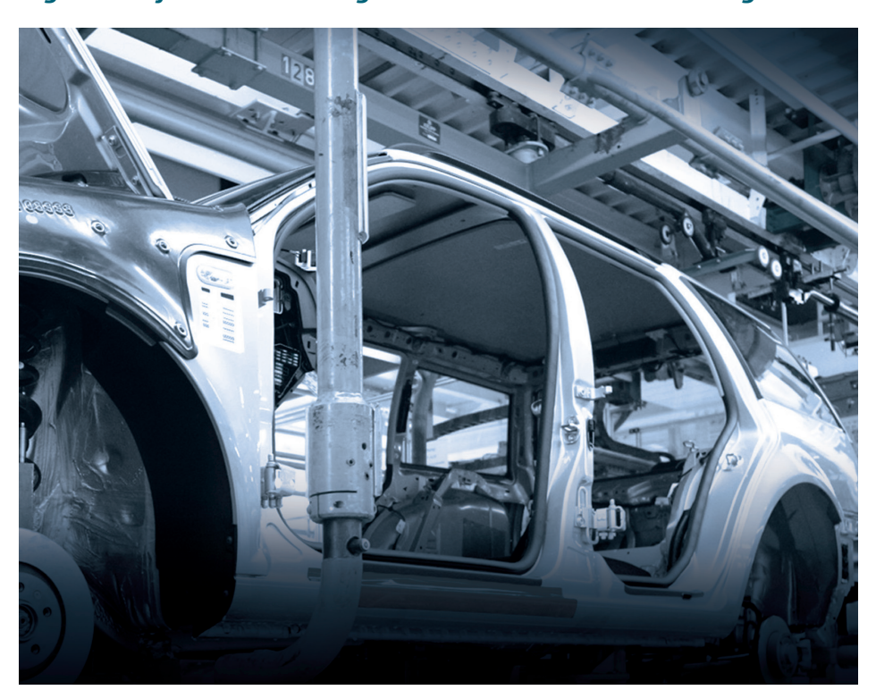
Fig. 2: Body-chassis marriage in automobile manufacturing